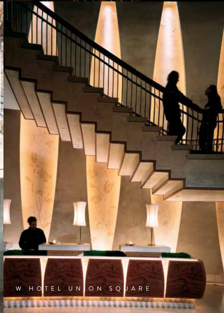
W HOTEL UNION SQUARE